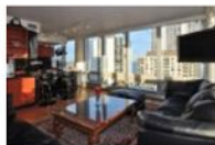
Real estate: Home page March 5, 2014