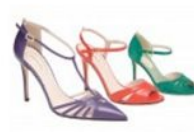
Things we love March 3, 2014