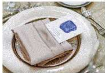
From far left: Maura's Ersa Atelier gown featured a detachable tulle overskirt, which she wore for the ceremony and photos and removed for the reception; each of the cake's tiers was a different flavor—the couple cut into the base, which was white buttercream with vanilla mousseline and fresh berries; menu cards featured a wax stamp of the couple's monogram, which also appeared on the dance floor and custom bar.